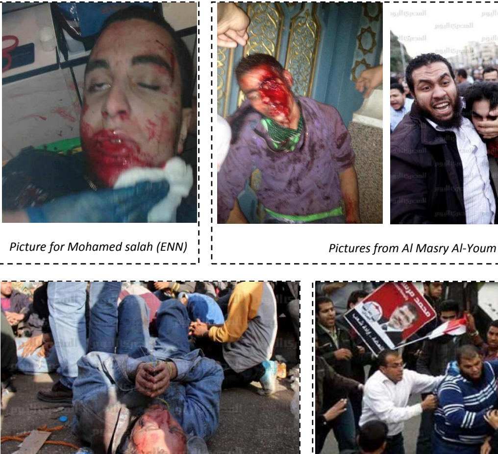
Some of the injuries sustained during the clashes