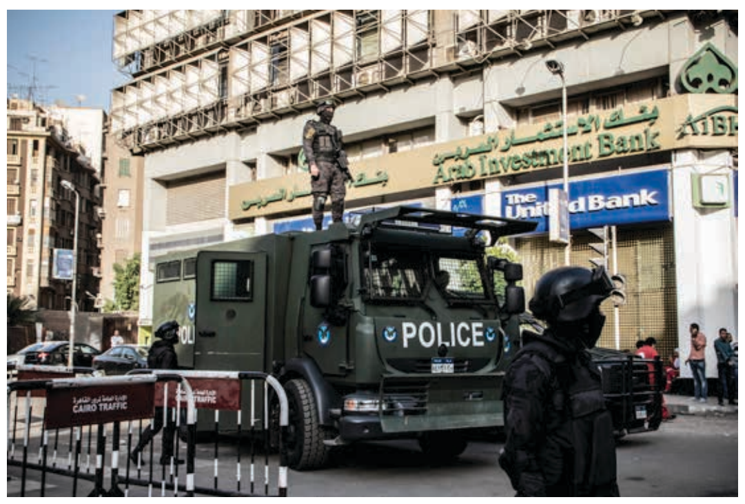
Sherpa MIDS, photographed in Cairo on 15 April 2016 next to the Journalists Syndicate