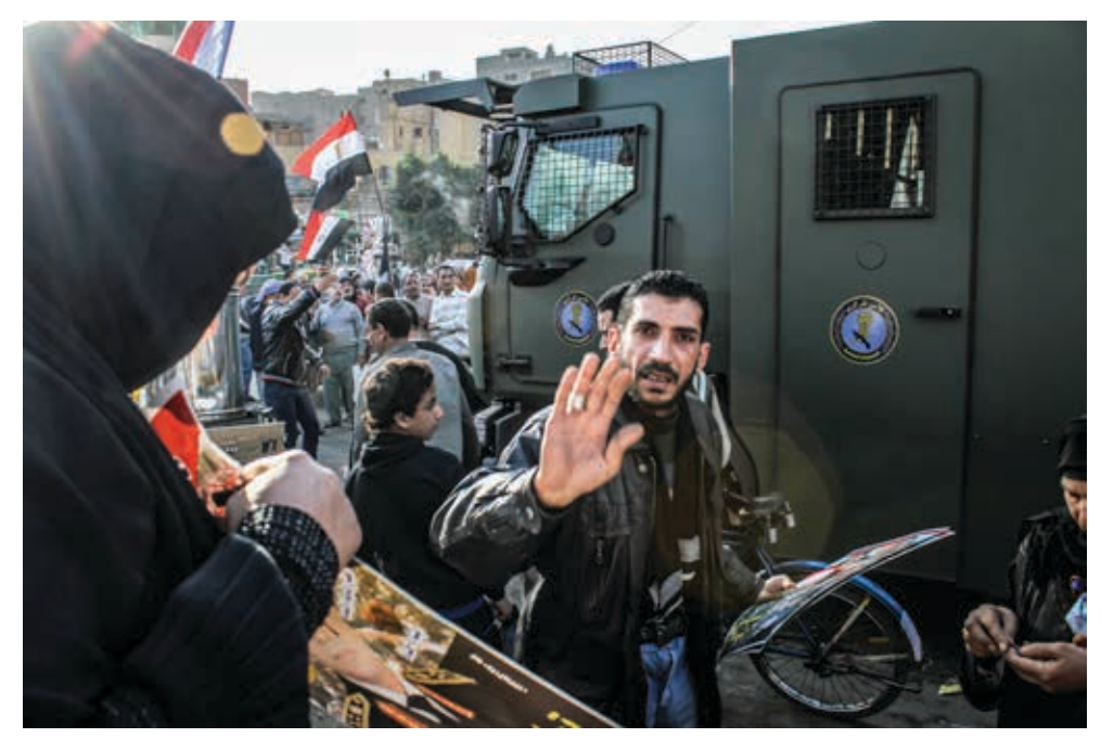
Sherpa MIDS photographed in Cairo on 24&25 January 2014.

deployment units have been seen in the ranks of mobile police patrols and other police patrol units in the streets of the Egyptian capital, as well as among protection brigades deployed in front of official buildings. The mobile patrols of the rapid deployment units are ordinarily deployed at night. It is also at night that one can see many armoured vehicles of the police circulating, driven by heavily armed police officers whose faces are usually covered by balaclavas. These rapid deployment units were created for deployment during complex security operations requiring a rapid response, in particular antiterrorist operations<sup>157</sup>. Some military leaders have officially stated that they were not created to respond to protests or gatherings<sup>158</sup>. RTD Sherpa vehicles were reportedly also deployed alongside security forces fighting against terrorism in the Sinai<sup>159</sup>.