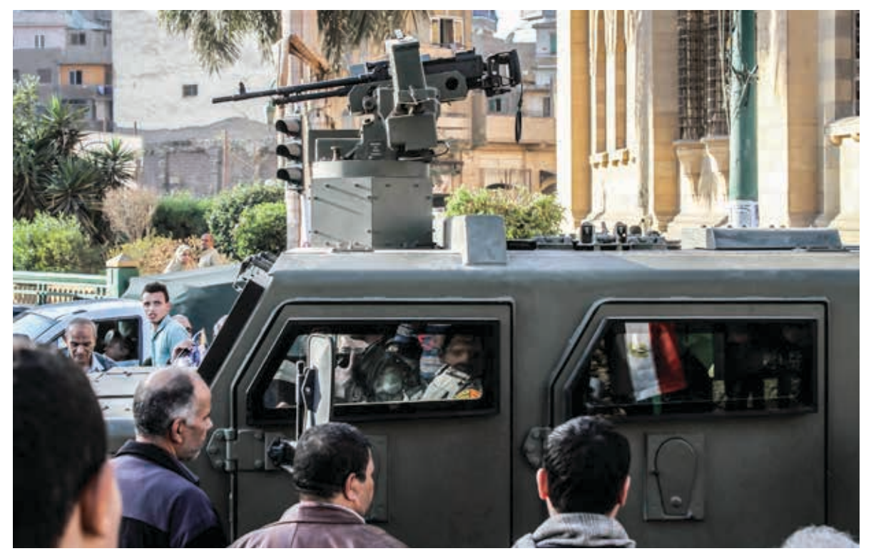
Sherpa MIDS photographed in Cairo on 15 April 2016, the day of a major mobilization against authorities, on the occasion of the handover by the Egyptian government of the Tyran and Sanafir islands to Saudi Arabia<sup>166</sup>.

Despite the verified presence of Renault Trucks Defense Sherpas (RTD) on the site of the Rabaa massacre and on the occasion of the deadly repression of the demonstrations of 24-25 January 2014 in Cairo, French authorities have continued to authorise the delivery to Egypt of RTD armoured vehicles, which have been used on other occasions by the Egyptian security forces in repressing demonstrations. On 15 April 2016, during protests against the handover by Egyptian authorities of the Tyran and Sanafir islands to Saudi Arabia, Sherpa MIDS were deployed in downtown Cairo, as shown in the photo below.