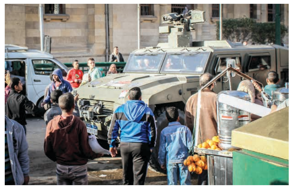
A Sherpa Scout photographed on 24 January 2014, Cairo

Despite the verified presence of Renault Trucks Defense Sherpas (RTD) on the site of the Rabaa massacre and on the occasion of the deadly repression of the demonstrations of 24-25 January 2014 in Cairo, French authorities have continued to authorise the delivery to Egypt of RTD armoured vehicles, which have been used on other occasions by the Egyptian security forces in repressing demonstrations. On 15 April 2016, during protests against the handover by Egyptian authorities of the Tyran and Sanafir islands to Saudi Arabia, Sherpa MIDS were deployed in downtown Cairo, as shown in the photo below.